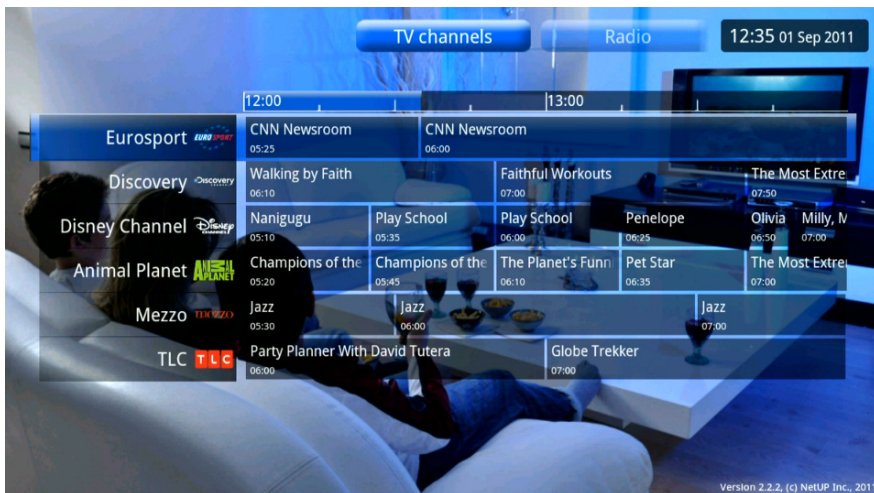
Figure 1. TV channels screen.

TV channels screen lists all available channels.